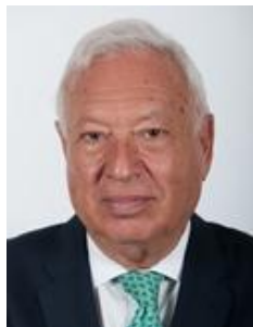
Mr José Manuel GARCÍA-MARGALLO Y MARFIL