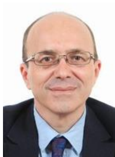
Mr André GATTOLIN

Vice – Chair of the European Affairs Committee